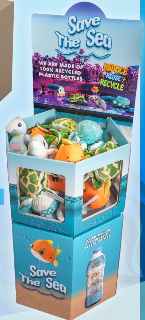
Dump bin for the plushes