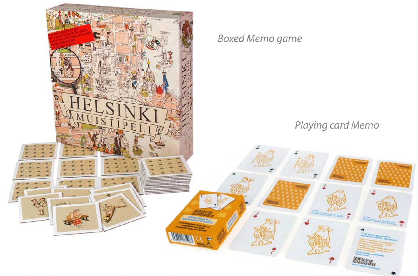
Boxed Memo game