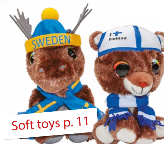
Soft toys p. 11