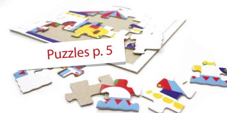
Puzzles p. 5