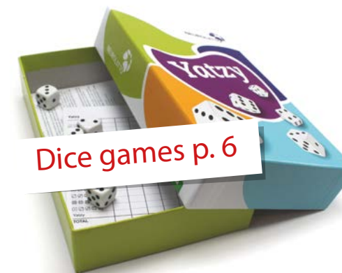
Dice games p. 6