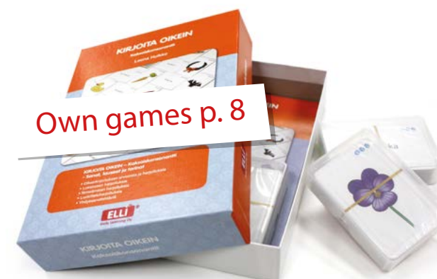
Own games p. 8