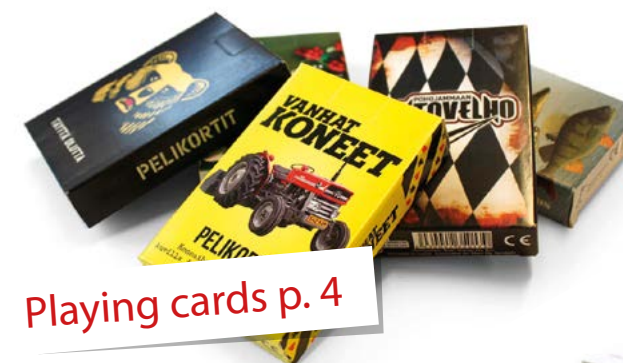
Playing cards p. 4