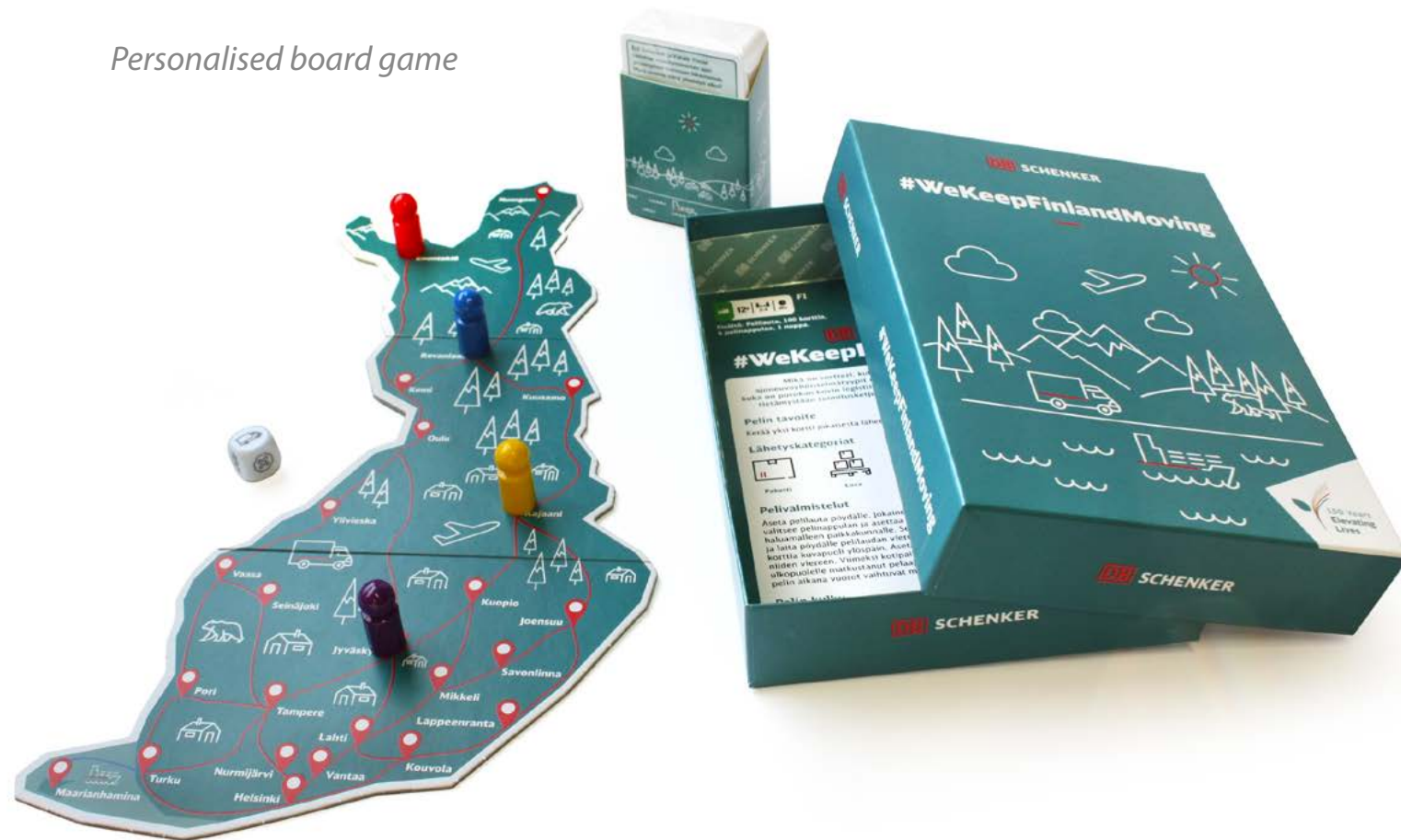
Personalised board game

Icebreaker and coaching games often contain text and picture cards, rules and a box. The games can be used to learn about the recognition of different emotions and think about how to process them. The cards can also contain tasks that promote e.g. linguistic skills.