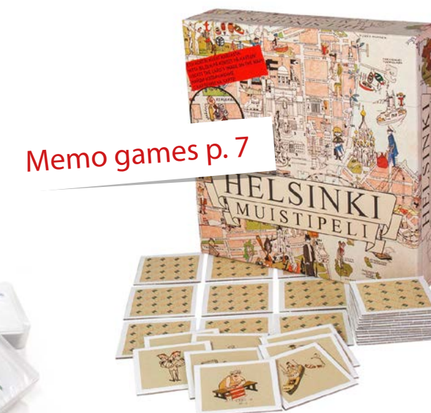
Memo games p. 7